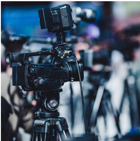
Media Interview

Hayward's piece de resistance was saved for his appearance in front of the House of Representatives Energy and Commerce Committee on 17 th June. He was in there for 7 hours. For the first 80 minutes he listened to speeches filled with vitriol, disdain and political points scoring hurled by a succession of US Senators. Then he got to make a short speech. This is where we'll kick off.